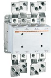
Power contactor B6301000