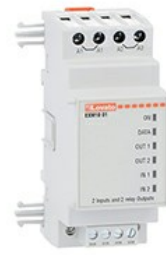
Expansion modules for modular products - inputs/outputs EXM1001