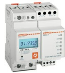
Single-phase energy meters DMED130LM single-phase 2