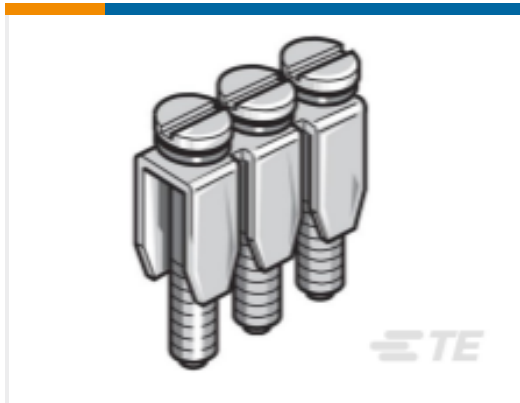
TE Part # 1SNA168519R0000 BJM6-5