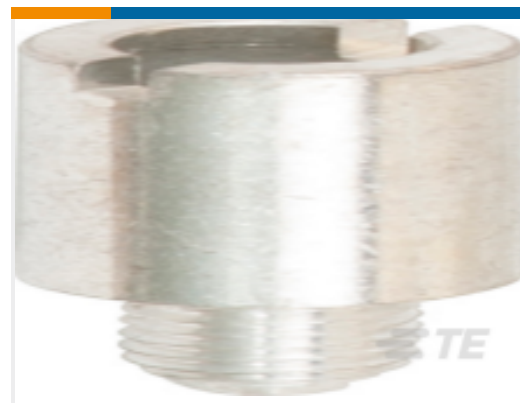
TE Part # 1SNA163261R0000 AL3