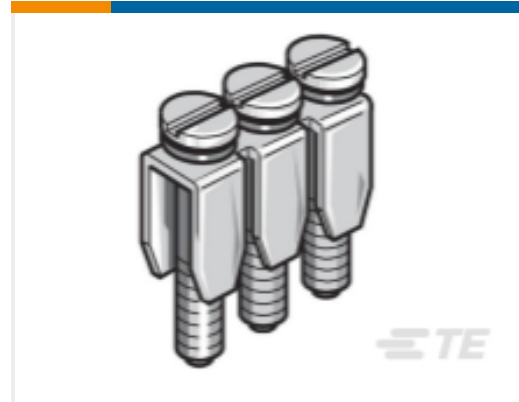
TE Part # 1SNA168518R0700 BJM6-4