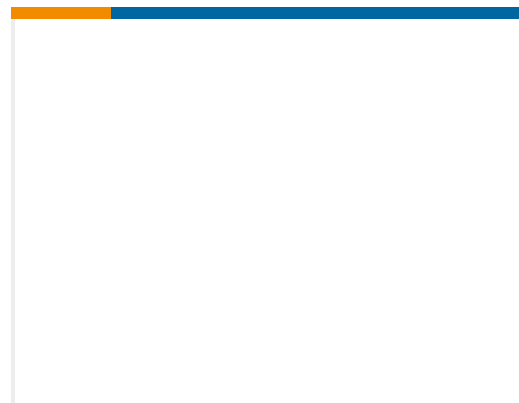
TE Part # 1SNA206394R0200 EV6I