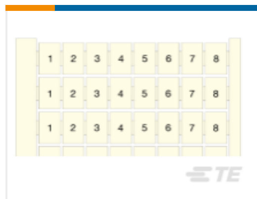
TE Part #1SNA238003R0500 RC1010 9->16 (X10) HORIZONTAL