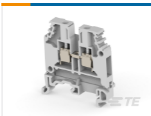
TE Part #1SNA115116R0700 M4/6