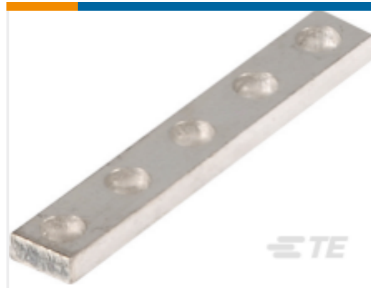
TE Part # 1SNA174784R2000 BJS6-20