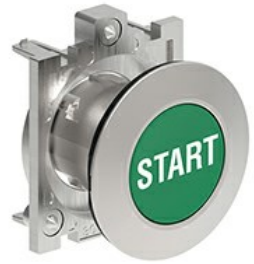
Pushbutton actuators, spring return, with symbol LPFB11