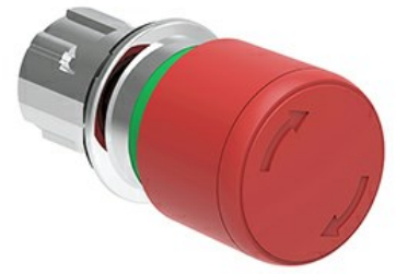
Mushroom head pushbutton, Latch, turn to release Ø 30mm/1.2" LPSB663