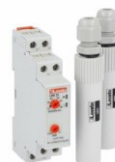
Level control relay LVM25240 with 2 x SN1 electrodes kit LVM25 Emptying or filling