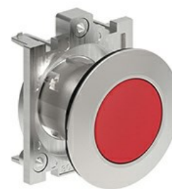
Pushbutton actuator, spring return LPFB10