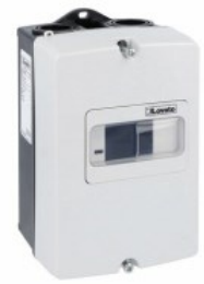
Surface mount enclosures IP65 (4X) for SM1P SM1Z Surface mount enclosures IP65 (4X) for SM1P SM1P...