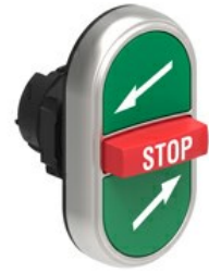
Triple-touch actuators, spring return - One middle extended buttons LPCB73