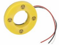
Illuminated disk for mushroom head pushbuttons - ISO13850 SYMBOL LPXDAU