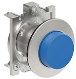
Pushbutton actuator, spring return LPFB20