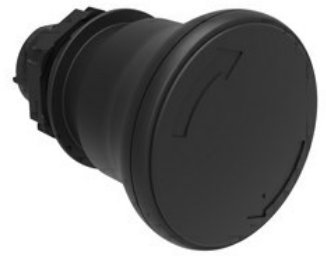
Mushroom head pushbutton, Latch, turn to release Ø 40mm/1.6" LPCB634