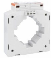
Current transformers DM5TP3000 Solid-core