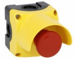
Yellow control station with shroud LPZP1A5P complete with mushroom pushbutton turn-to-release LPCB6644 1NC LPZP1B5P603