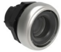
ILLUMINATED flush-extended push-push actuator with no lens LPXQL0