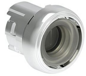
Illuminated actuator without cap LPSXQL0