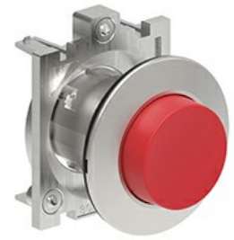
Pushbutton actuator, spring return LPFB20