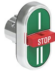
Triple-touch actuators, spring return - One middle extended buttons LPSB73