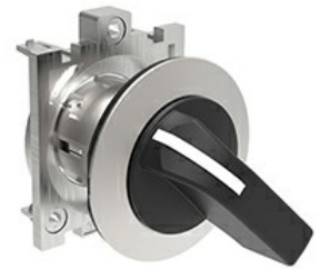
Selector switch actuators long lever - 3 position LPFS23