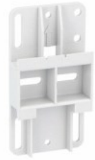
Universal base to screw fix for BF09...BF38 BFX8901