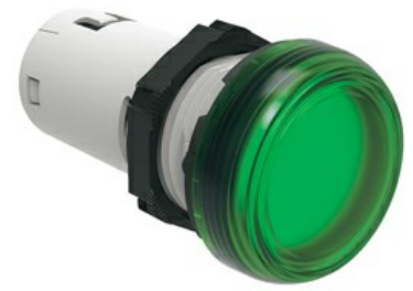
LED integrated monoblock pilot lights steady light LPML