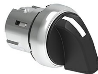
Selector switch actuators lever - 3 position LPSS13