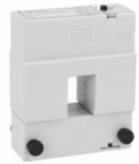
Current transformers DM0TA0200