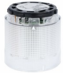
Signal tower Ø70mm/2.75" 8TL7