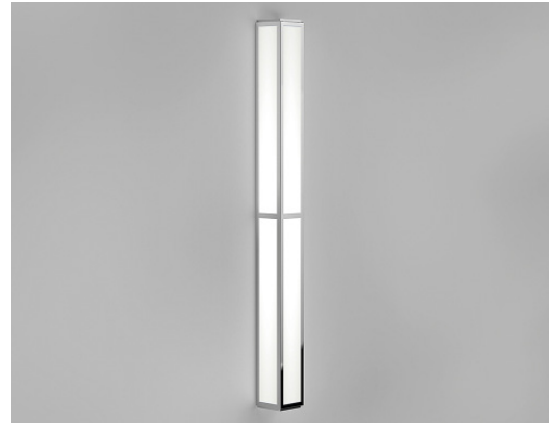
CODE: 1121066 FINISH: POLISHED CHROME

TO MAINTAIN THIS PRODUCT TO ITS BEST CONDITION, PLEASE VIEW OUR CARE AND CLEANING GUIDE ON THE SUPPORT SECTION OF THE ASTRO WEBSITE.