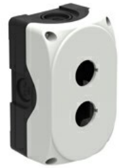
Plastic control station without actuators - for 2 actuators LPZP2A8