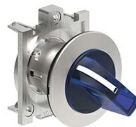
Illuminated selector switch actuator - 3 position LPFSL13