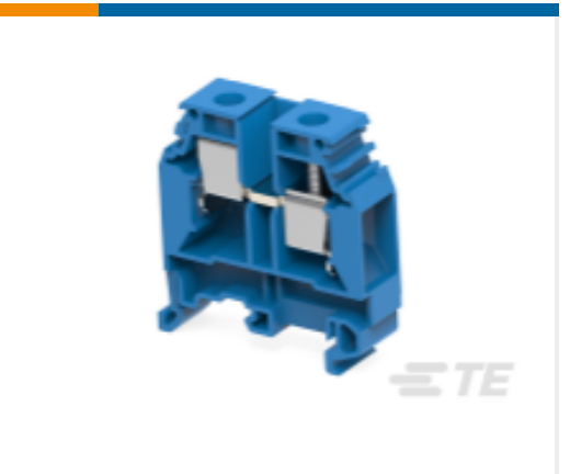
TE Part #1SNA125129R1600 M16/12.N