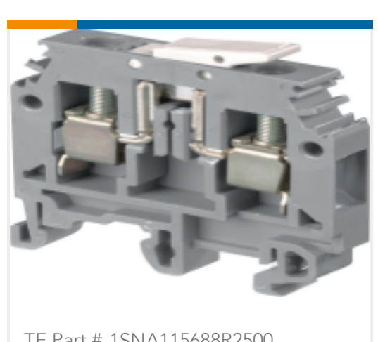
TE Part # 1SNA115688R2500 M6/8.SNB