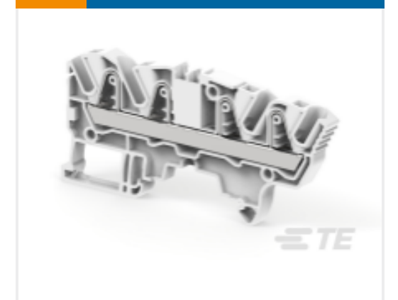
TE Part #1SNK706012R0000 ZK4-4P