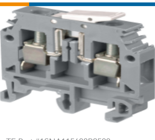
TE Part #1SNA115688R2500 M6/8.SNB