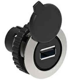
USB interface, B/A female type connection LPFD0