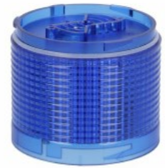
Signal tower Ø70mm/2.75" LTN70