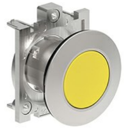
Pushbutton actuator, spring return LPFB10