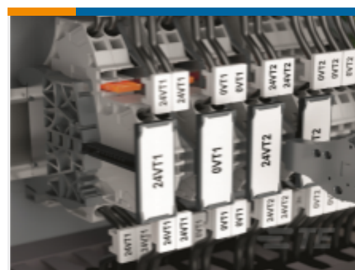
TE Part # 1SNK900630R0000 MCLH