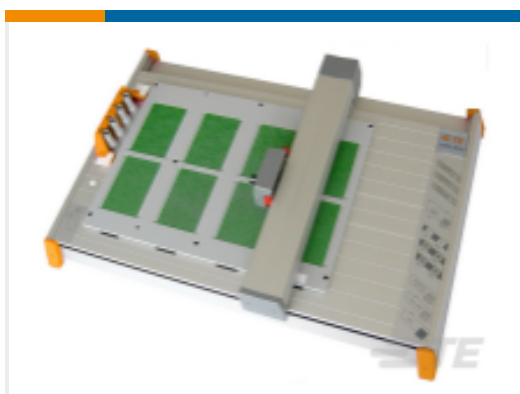
TE Part # 1SNA360000R2400 AMS 600 KIT