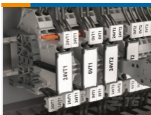
TE Part # 1SNK900631R0000 MCLH-R1