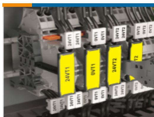
TE Part # 1SNK900633R0000 MCLH-YL