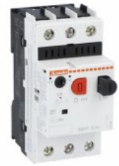
Motor protection circuit breaker SM1P