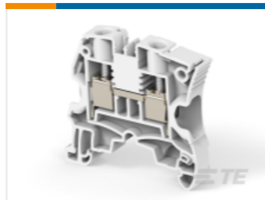
TE Part #1SNK508065R0000 ZS10-WH