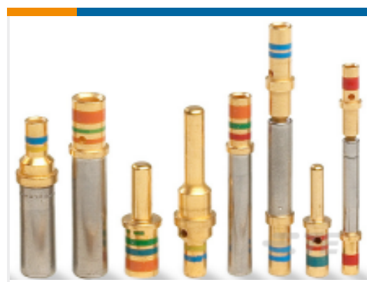
TE Part #38943-22L CONT SOC ASSY