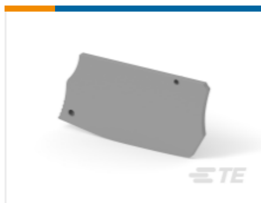
TE Part #1SNK505910R0000 ES4