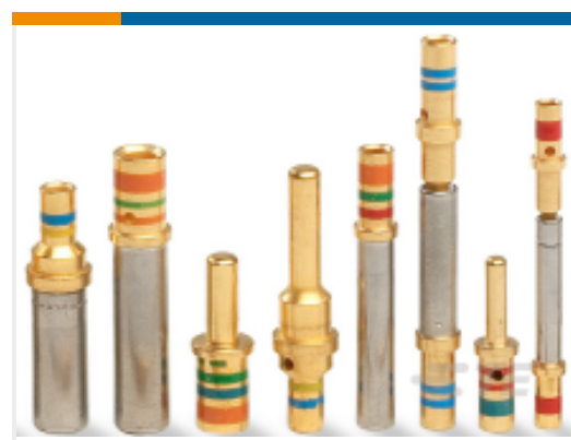
TE Part #38943-20L CONTACTS (=724-0007-20)