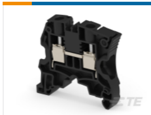
TE Part #1SNK508066R0000 ZS10-BK