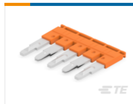
TE Part #1SNK908305R0000 JB8-5