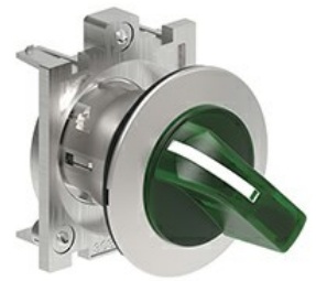
Illuminated selector switch actuator - 3 position LPFSL13