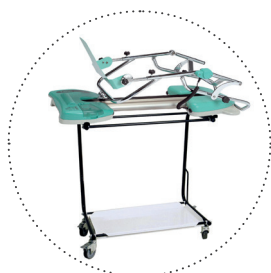
Trolley for all Knee CPMs