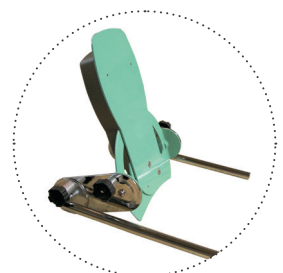
Paediatric foot plate