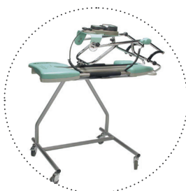
Cart for bed use