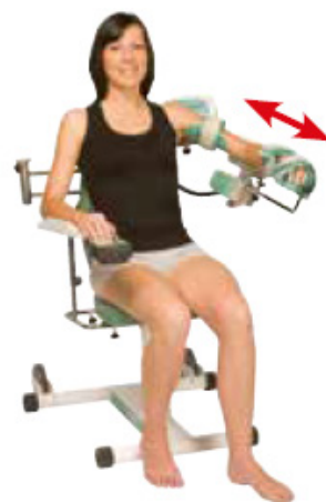
Elbow Flexion/Extension -10^{\circ} to 135^{\circ} Kinetec CEM™ with chair