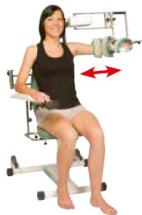
Horizontal abduction -30^{\circ} to 110^{\circ} Kinetec Centura™ 2 motors with the accessory