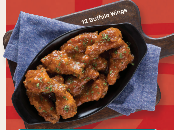
12 Buffalo Wings

Spur is not a gluten- or allergen-free environment. While every effort is made to minimise allergen contact when requested, traces may still be present. Our kitchens handle allergens like nuts, gluten, wheat, shellfish, lactose, and egg. Plant-based meals are cooked on separate surfaces but prepared in kitchens that also handle animal products. Visuals are for illustrative purposes only. Prices include VAT and are in ZAR. Service charges are not included. Items are subject to availability, and cheques are not accepted. E&OE.