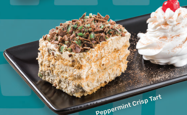
Peppermint Crisp Tart