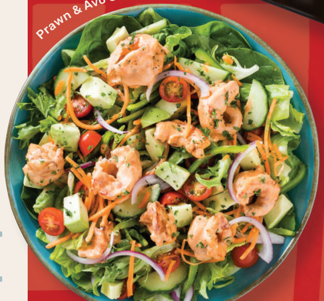
Prawn & Avo Salad