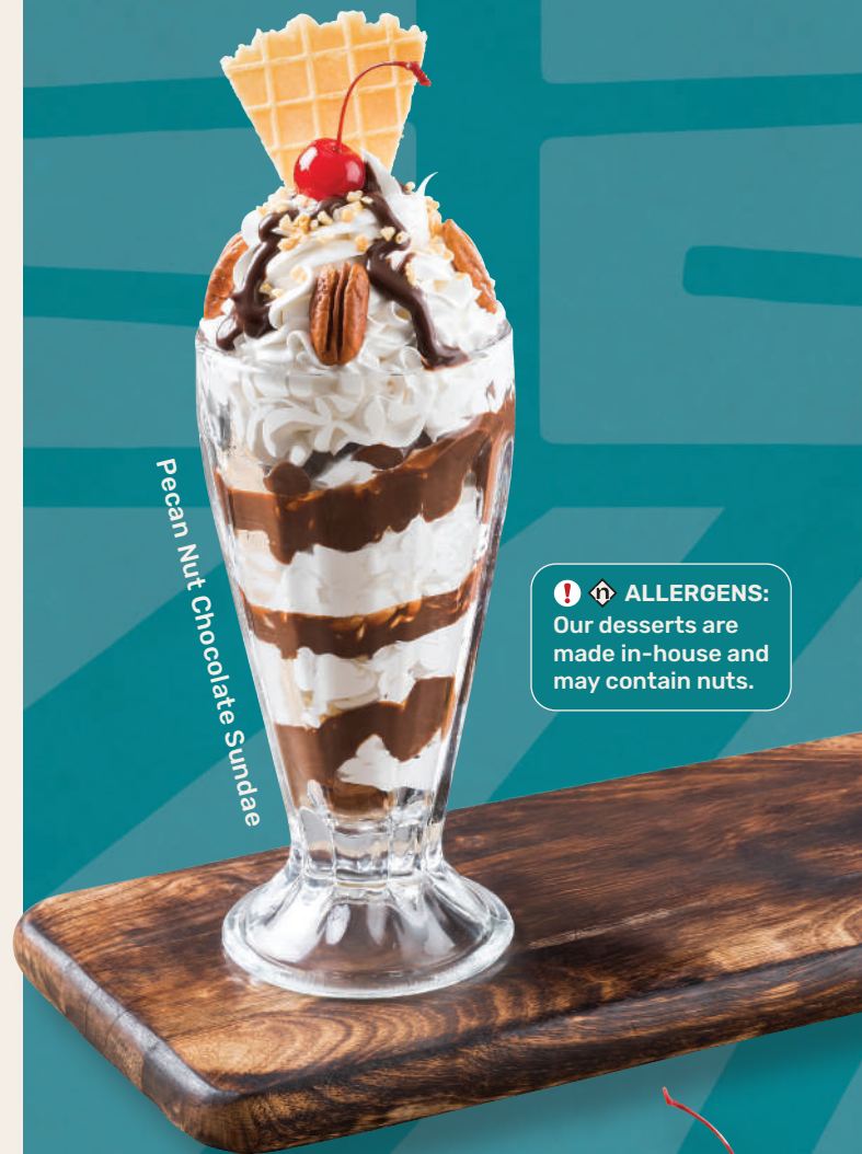
Pecan Nut Chocolate Sundae

⚠ ⚠ ALLERGENS: Our desserts are made in-house and may contain nuts.