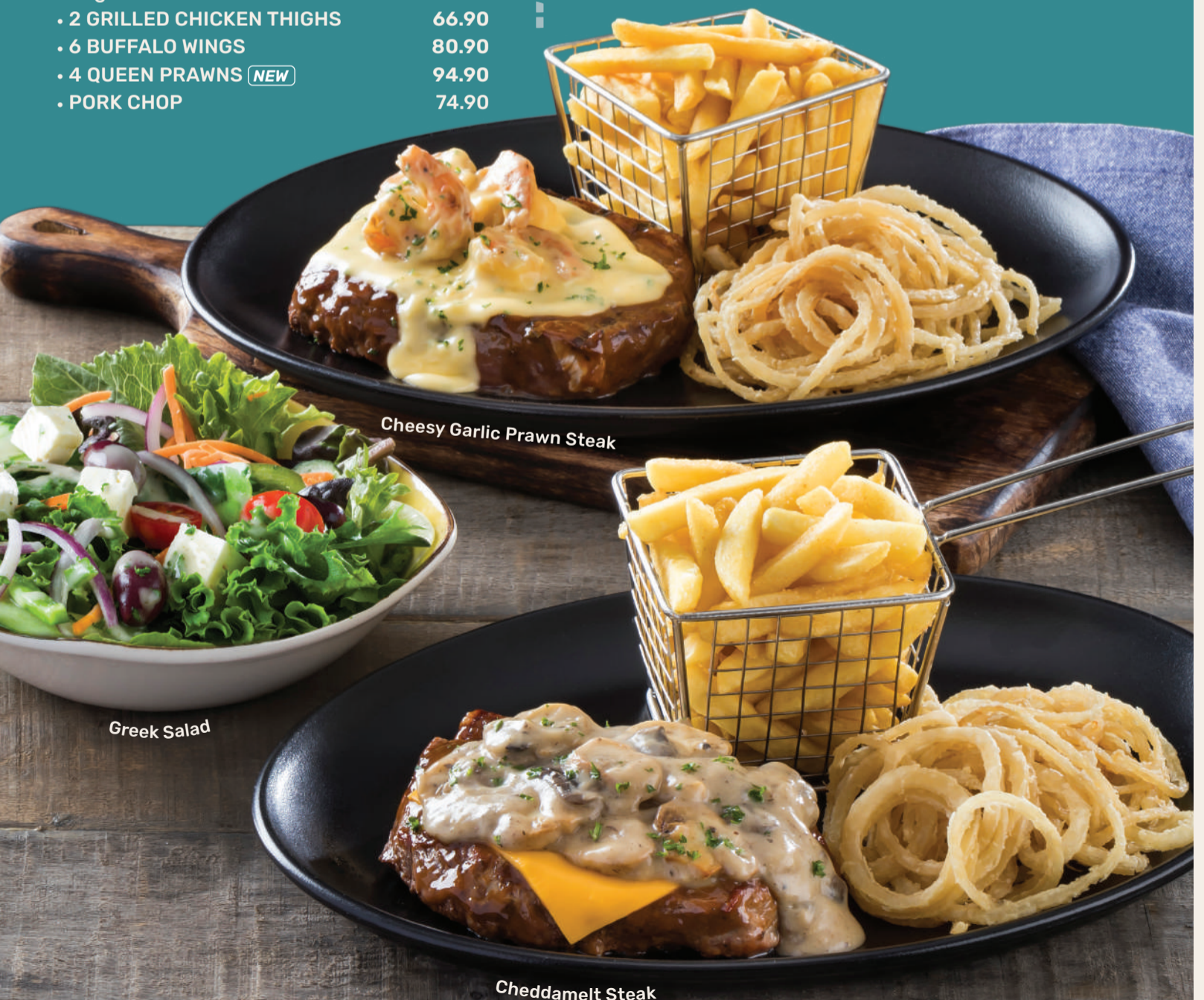
Cheesy Garlic Prawn Steak