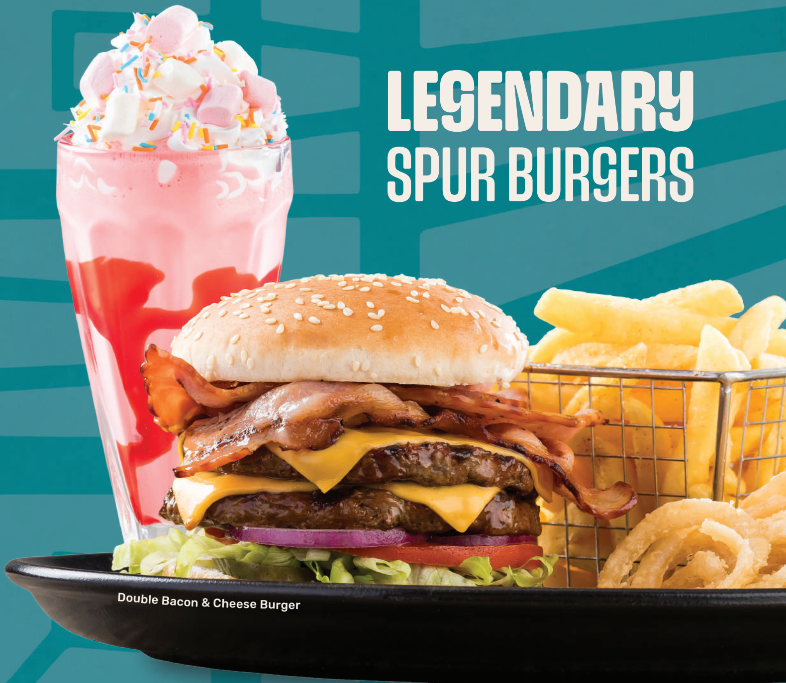
Double Bacon & Cheese Burger