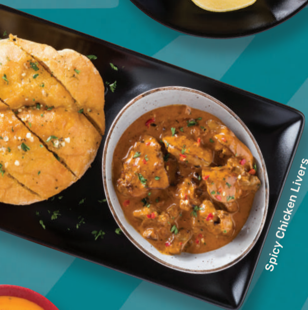
Spicy Chicken Livers