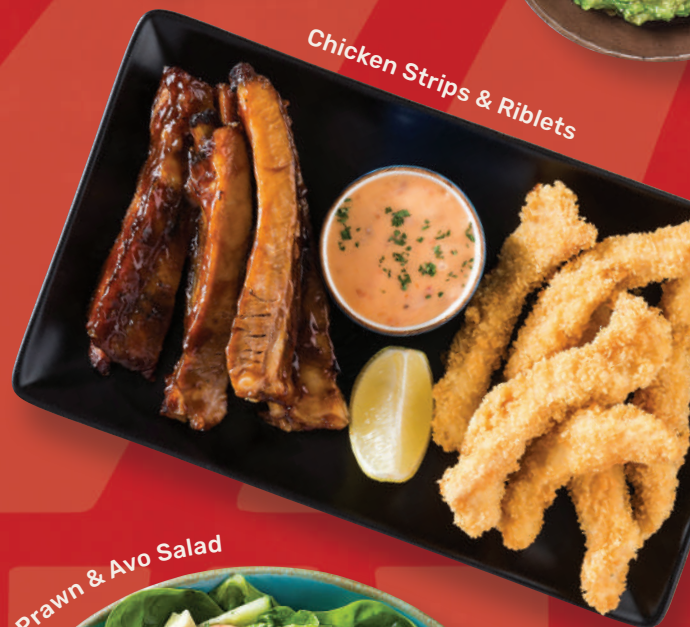
Chicken Strips & Riblets