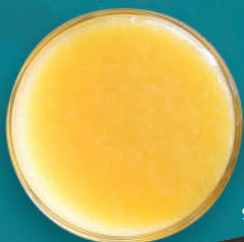
Spicy Roast Chicken Mayo