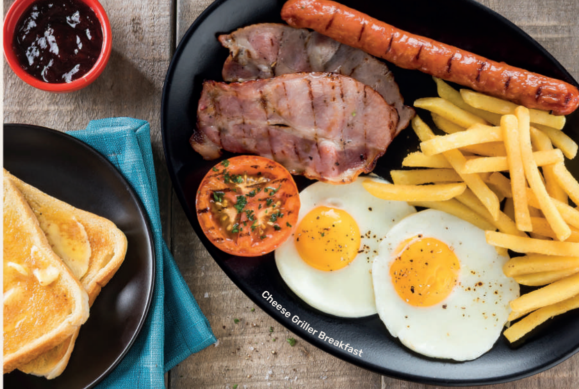
Cheese Griller Breakfast