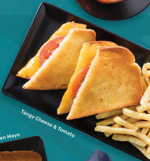
Tangy Cheese & Tomato