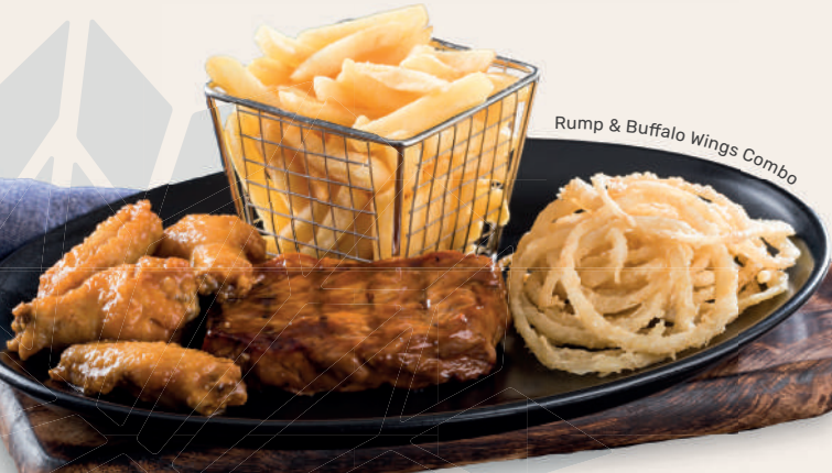
Rump & Buffalo Wings Combo