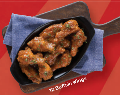
12 Buffalo Wings

BUFFALO WINGS 8 Wings ~ 109.90 12 Wings ~ 149.90 Tossed in Durky Sauce. Served with Durky Sauce and Roquefort dressing.