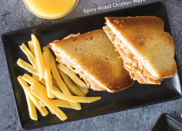
Spicy Roast Chicken Mayo