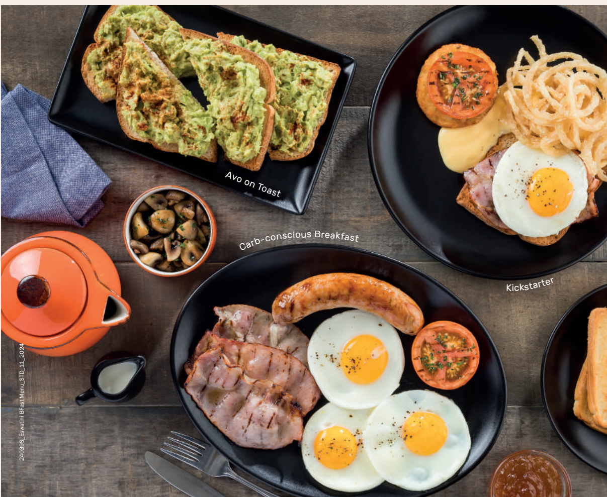
Avo on Toast