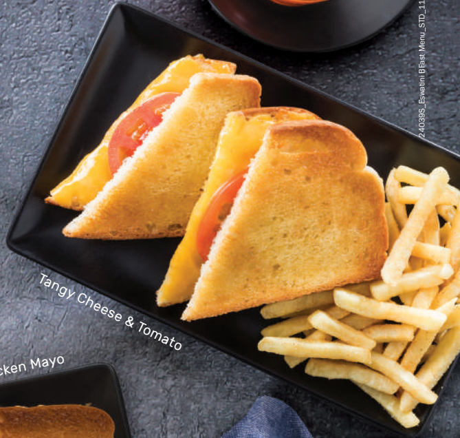
Tangy Cheese & Tomato