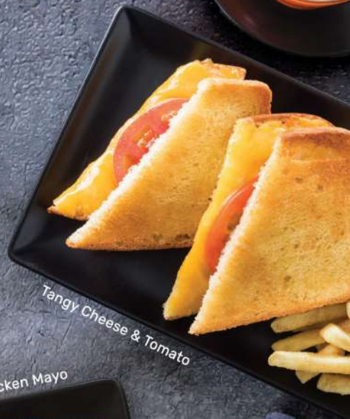
Tangy Cheese & Tomato