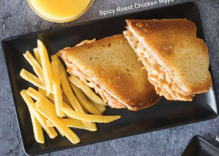
Spicy Roast Chicken Mayo