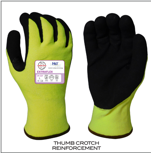
THUMB CROTCH REINFORCEMENT