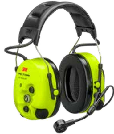
MT15H7AWS6 / MT15H7AWS6-111