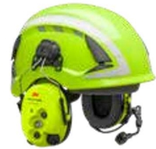
MT15H7P3EWS6 / MT15H7P3EWS6-111