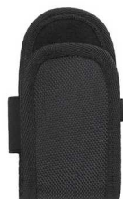
A41014-7 Universal Safety Knife Fabric Holster