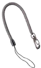
A42001-9 Clip-on Coil Lanyard