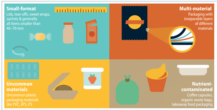
Fig. 2. Redesign required: about 30% of plastic packaging (measured by weight) cannot be mechanically recycled without a fundamental redesign Source: Ellen MacArthur Foundation, graphic: © Hanser