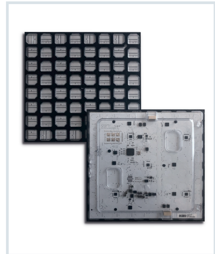
Fig. 2. Ready for assembly: there is space for 64 glass mosaic tiles on the top side of the electronics housing

In the years since then, the light technology company has won various prizes for its modern lighting design and is selling the glass mosaics in increasing numbers worldwide. ■