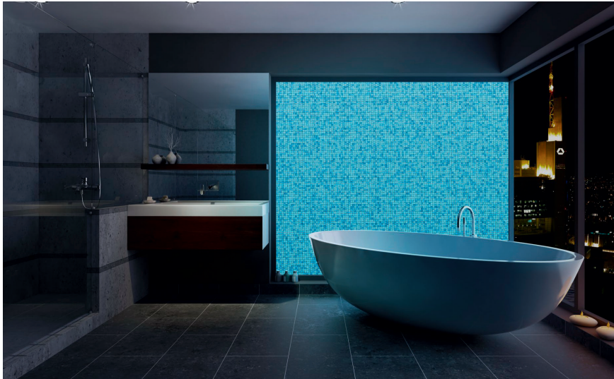
Fig. 1. The light module electronics must be situated in a tightly welded protective plastic housing for wet applications

cation. In contrast, laser transmission welding is gentle – without chemical, thermal, or mechanical influences on the surrounding material.