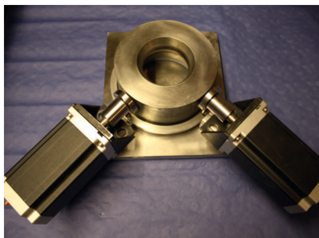
Fig. 2. Complete retrofit kit (mounted on a base plate) for an existing blown film die. With the aid of two stepping motors, the required position of the die with respect to the mandrel can be adjusted with maximum precision