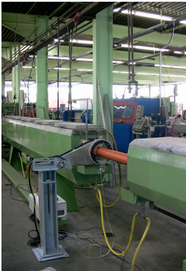
Fig. 4. New measurement system for online sensing of the wall thicknesses of solid or foam-core pipe, integrated into the pipe extrusion line downstream of the first vacuum tank

All technical prerequisites are now essentially available in the field of pipe extru-