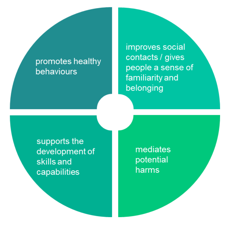
Figure 1: Ways in which greenspace may be linked to positive health outcomes

For all these reasons, improving access to quality greenspace has the potential to improve health outcomes for the whole population. However this is particularly true for disadvantaged communities, who appear to accrue an even greater health benefit from living in a greener environment (5). This means that greenspace also can be an important tool in the ambition to increase healthy life expectancy and narrow the gap between the life chances of the richest and poorest in society (6).